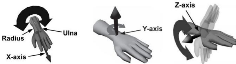
Fig 2.1, 2.2, 2.3 Hand rotation in X, Y, Z axes.