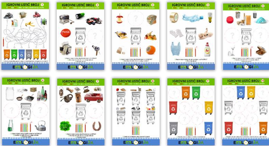
Figure 4. Folder layout and 10 play sheets