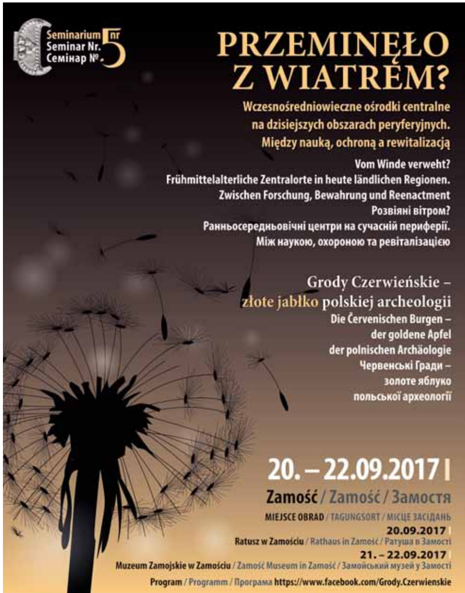
Fig. 2. The poster for the conference Gone with the Wind?... Zamość, 20 th –22 th 09.2017 (Designed by M. Bujak)