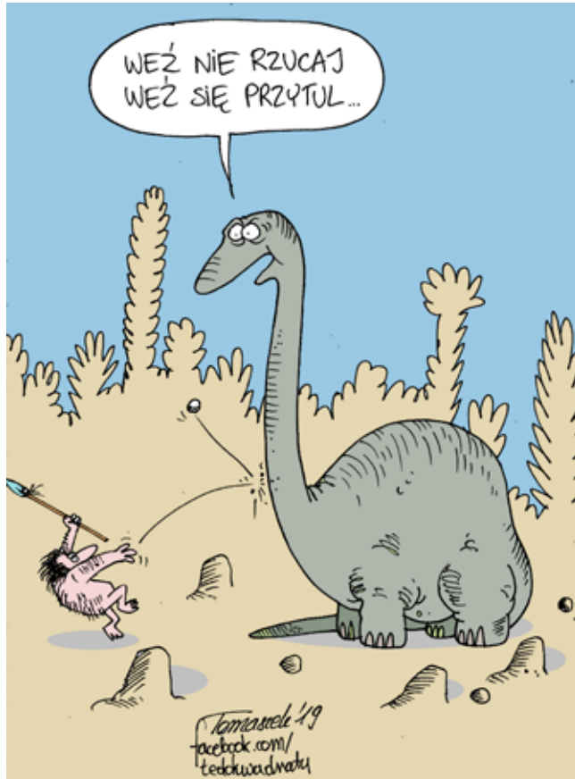
Fig. 1. A drawing inspired by Ewa Kopacz's comment on the fight which early humans fought against dinosaurs; the captions reads: Don't hurl at us, give us a hug!

The fact that information cocoons / filter bubbles influence our lives can be easily verified by following the political debate which is ongoing in many European countries – the convinced convince the convinced who look down on those who have been convinced to believe something else. This phenomenon also has an impact on other aspects of our lives: anti-vaxxers communicate only with fellow anti-vaxxers etc.