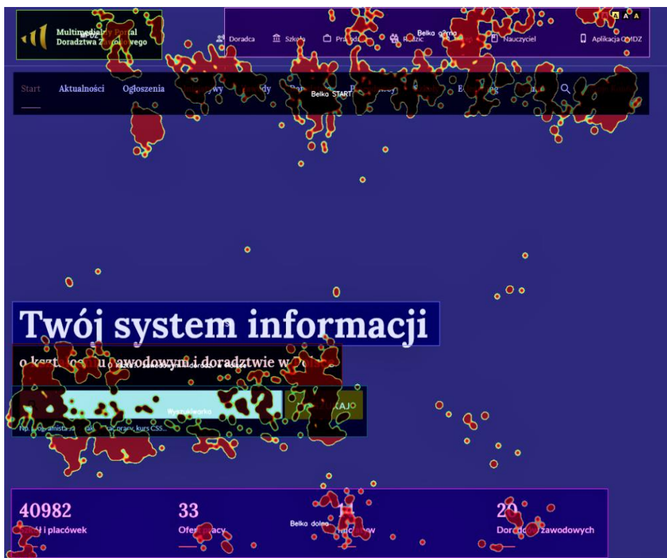
Picture 1. Home page of the MPDZ portal. An example of a heat map generated as average values for viewing time at the site during 10 seconds of the test

values for: dwell time for defined AOI, number of fixations in AOI, number of revisits to AOI.