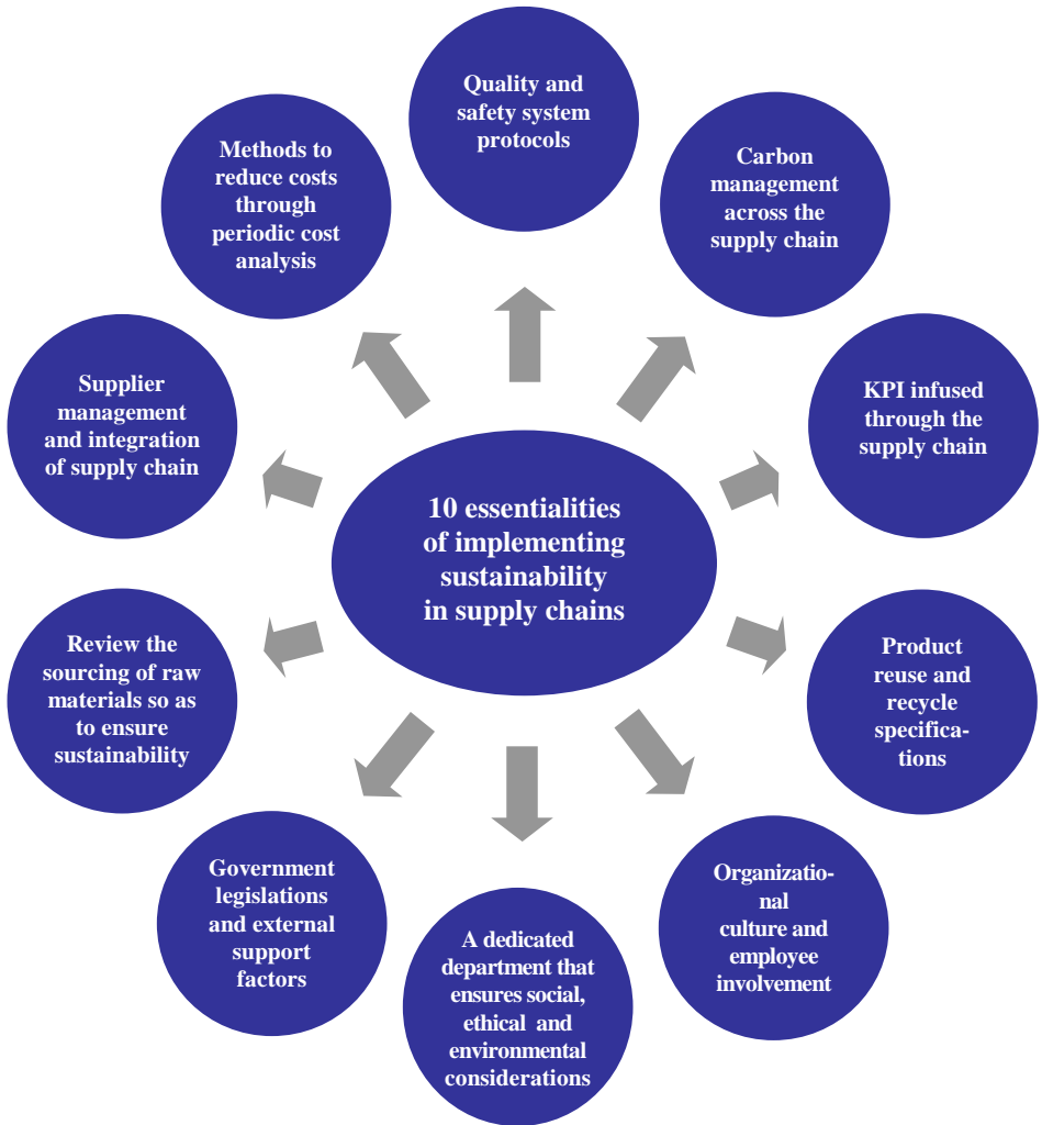
Figure 2. Essentialities of supply chain management