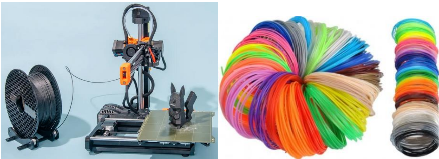
Figure 1. 3D printer and filament with different colours

A material is supplied in the shape of printing filament. It is extruded by heated nozzle in head of 3D printer – it is the most common technology of 3D printing and also the most cheep alternative. The price of such 3D printers is from hundreds Euro (printers used at home)to tenths thousands Euro (professional). The technology of 3D printing is convenient for printing of functional models and prototypes that are after printing ready to be used immediately. A material for 3D printing is from thermoplastic, twisted in coil. Material is gradually supplied into extruder – printing head.