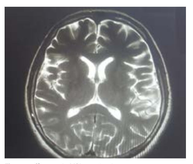
Figure 2. Changes in MRI examination

The incidence of hearing loss in patients with RHS has been shown to range from 6.5% to 85%. According to Chang et al., the incidence of hearing loss in patients