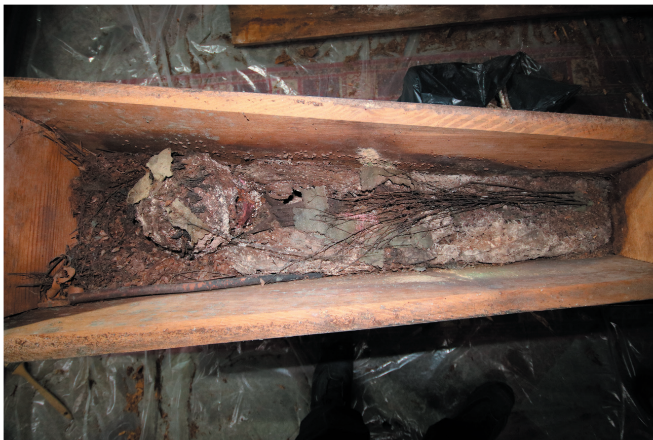
Fig. 1. Burial no. 37/2018.

Material for macroremains analysis was dry-sieved on 0.2 mm and 0.5 mm sieves. Each fraction was sorted with the use of a stereoscopic microscope, while specialized atlases (Marek 1954; Kulpa 1974; Cappiers et al. 2006; Cappiers, Bekker 2013) were used for identification. The accuracy of the identification was compared with the collection of carpology collected in the Laboratory of Paleoecology and Archaeobotany