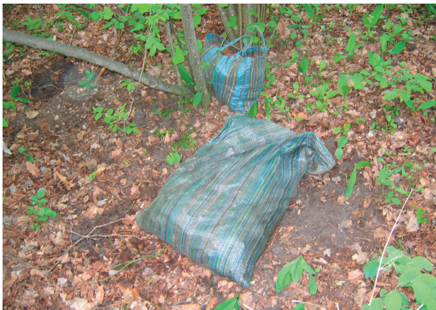
Fig. 6. A sack and a bag with flint material from the mining field of “Koryczna” mine in Wojciechówka abandoned by prospectors.