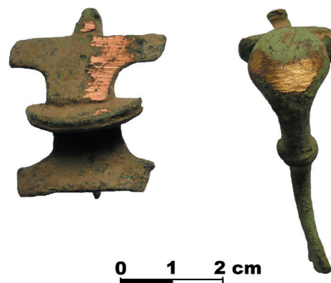
Fig. 2. Traces of the “exploration” of the material on the fibulae from the scrapyard in Milczany.

Fibulae of the Almgren type 43 are regarded as the most characteristic articles of the broadly-understood Przeworsk Culture. They appeared during the period of the Marcomannic Wars in 166–180 AD. In archaeology, their occurrence is associated with the middle Roman period (phases B2/C1–C1a), yet they were most common in phase B2/C1. Fibulae of type A.41 are of great significance to the determination of migration of the Przeworsk Culture. The participation of its representatives as “ superiores barbari ”, understood as Vandal tribes, in military activities are