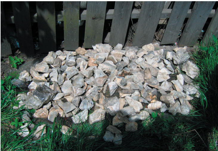
Fig. 4. Semi-finished products, production waste and lumps of material from “Koryczna” striped flint mine in Wojciechówka waiting to be sold to souvenir manufacturers by one of the inhabitants of the village.

The use of recovered archaeological artefacts as raw material for further processing is not an entirely new phenomenon, but so far it certainly has been overlooked as a significant risk threatening archaeological heritage. Moreover, the mitigation of this issue is not well supported by the existing legislation.