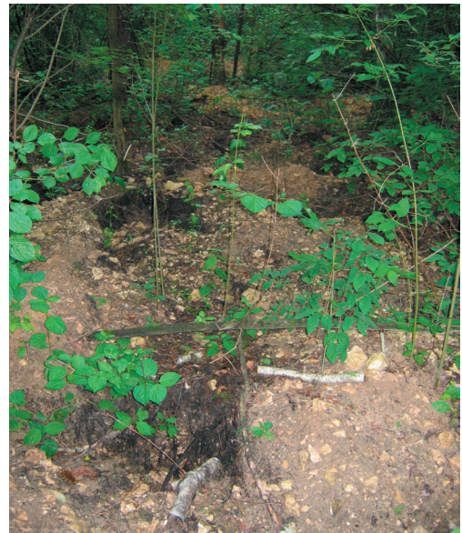
Fig. 5. Mining field of “Koryczna” mine in Wojciechówka dug out by the prospectors looking for striped flint.