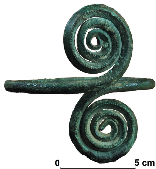
Fig. 3. Bracelet from the scrapyard in Jasice, Wojciechowie commune.