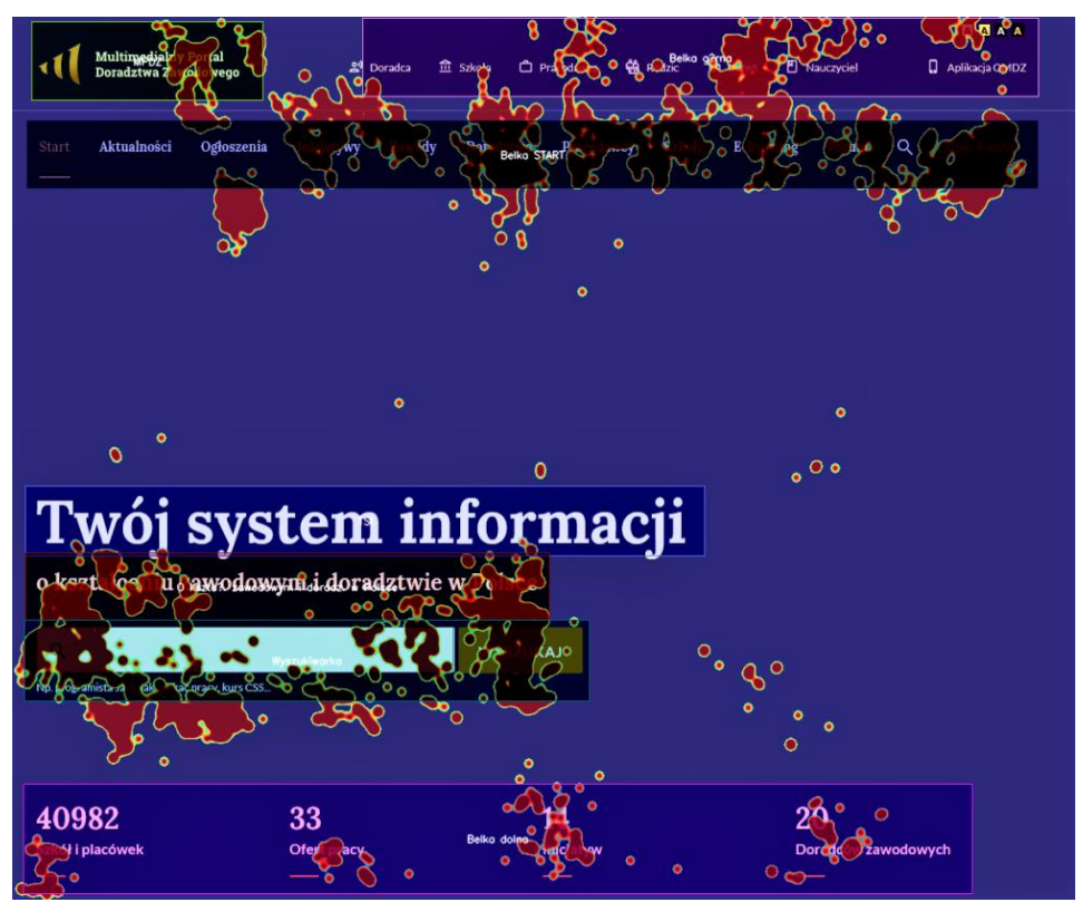
Picture 1. Home page of the MPDZ portal. An example of a heat map generated as average values for viewing time at the site during 10 seconds of the test

values for: dwell time for defined AOI, number of fixations in AOI, number of revisits to AOI.