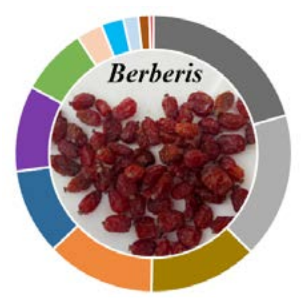
Figure 1. The basic applications and properties of Berberis . The percent of publications pertaining to individual Berberis properties are as follows:

dictyophylla, Berberis julianae, Berberis thunbergii and Berberis verruculosa. <sup>1-3</sup>