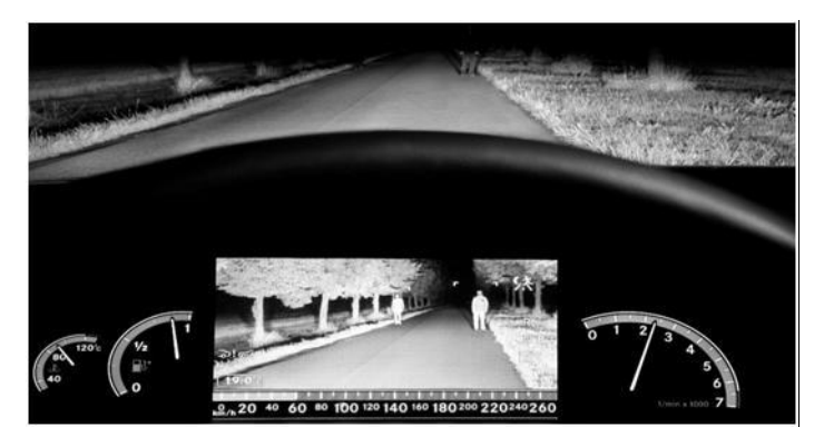
Fig. 1. Display system of vehicle equipped by night vision [Internet]