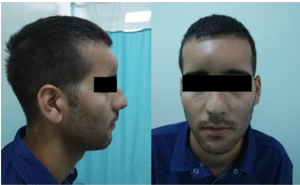
Fig. 1. An 8 cm x 8 cm fluctuant, tender, warm swelling over the forehead

tests were all within the normal range. Pott's puffy tumor was explained as a rare complication of current